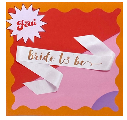
Standard CMYK Printing CMYK Pritning