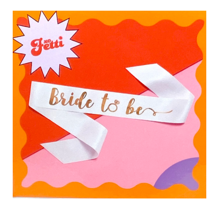
Blue Bee Printing RGB Printing

To avoid this issue entirely, a printer must have RGB color capabilities. If you have artwork in RGB definitely ask your printer if they can print in RGB color space.